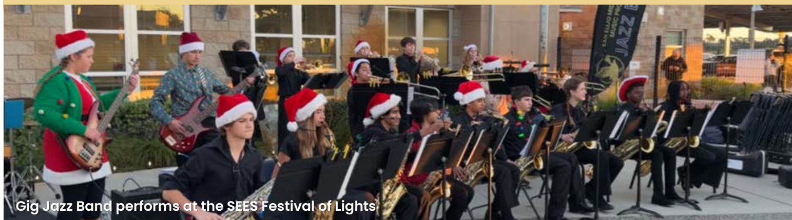
Gig Jazz Band performs at the SEES Festival of Lights

Official newsletter of SEMS Music Program Boosters