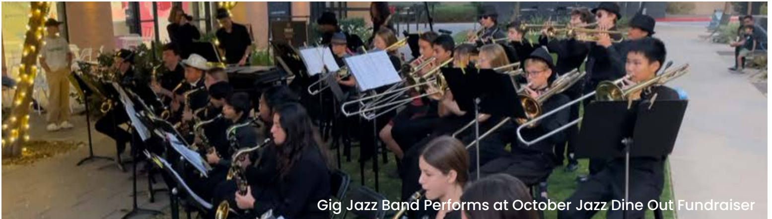
Gig Jazz Band Performs at October Jazz Dine Out Fundraiser