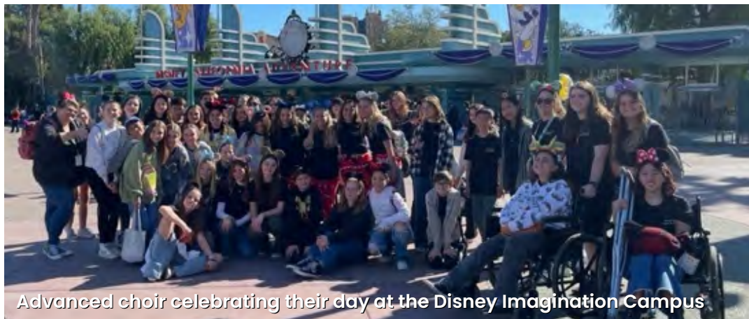
Advanced choir celebrating their day at the Disney Imagination Campus

set to Disney film footage. The musicians got to spend the evening in Disneyland blowing off steam and bonding. We are so excited to be able to offer this wonderful experience year after year.