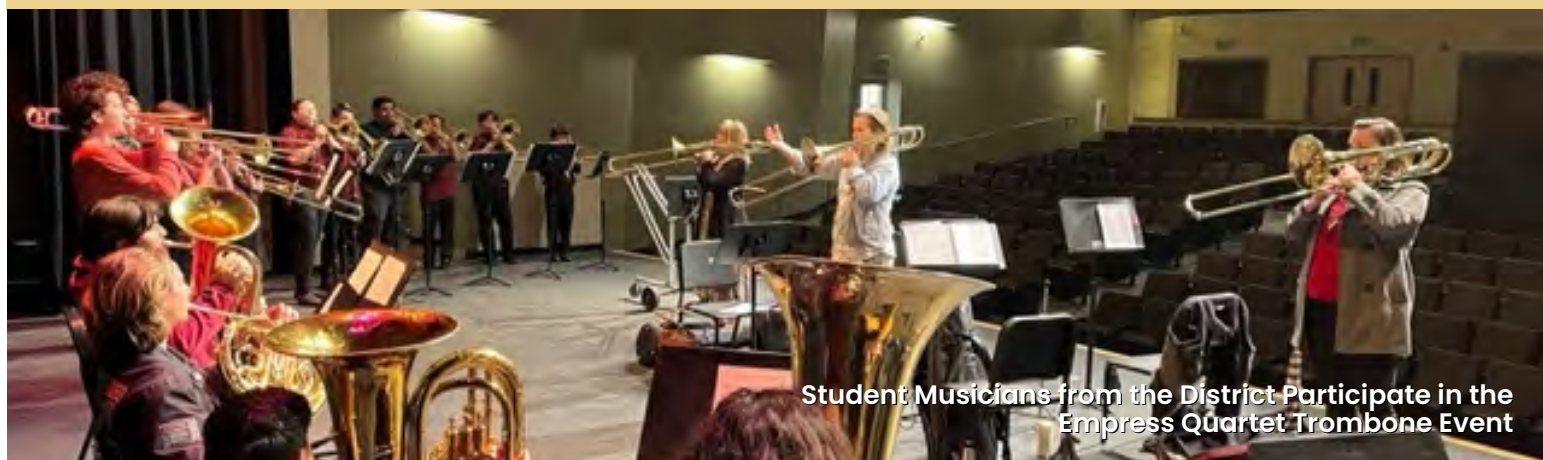
Student Musicians from the District Participate in the Empress Quartet Trombone Event

Official newsletter of SEMS Music Program Boosters