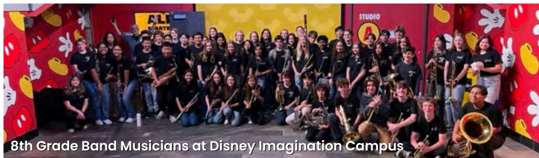
8th Grade Band Musicians at Disney Imagination Campus

The Music Department started the Spring Accelerando strong with the 8th Grade Band students and the Advanced Choir participating in the Disney Imagination Campus Performing Arts Workshops Soundtrack Sessions. During these workshops, our musicians sight-read music and worked directly with industry professionals to create a truly magical ensemble piece. The experience culminated with a screening of their recorded work (continued on page 2)